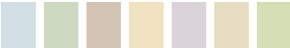
Background color examples

Think of it like a musical group. Your two main colors are like the lead singers. You want two additional colors that provide the "ooohs" and "aaahs" in the background that add to the overall color song, but that never compete with the main melody.