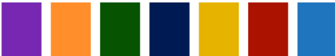
Accent color examples

Whatever accent color you pick, choose it after you've found two main colors and two background colors, because this color needs to stand out from those.